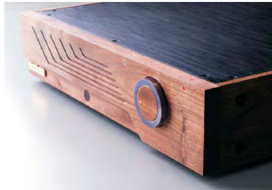
Preamplifier SG-400 & SG-410