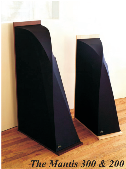
The Mantis 300 & 200